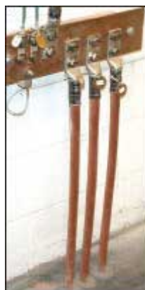
Figure 7. Penetrations through floors are lined with PVC to avoid the risk of fire. Metallic penetrations can suffer hazardous resistive heating when large surge currents pass through the grounding conductors. Connection lugs are tinned copper.