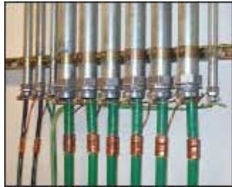
Figure 8. In most instances, large grounding conductors at the DPTE are not encased in conduit, but one tenant elected to do so in its system. The IEEE-recommended practice for this installation calls for bonding the conductor to the conduit at both entrance and exit points.

as installed by a DPTE tenant for its grounding system. Encasing grounding conductors in this manner is an IEEE recommended practice. It avoids increased voltage drop along the conduit during a surge and takes advantage of the lower voltage drop offered by the large-diameter conductor. 5