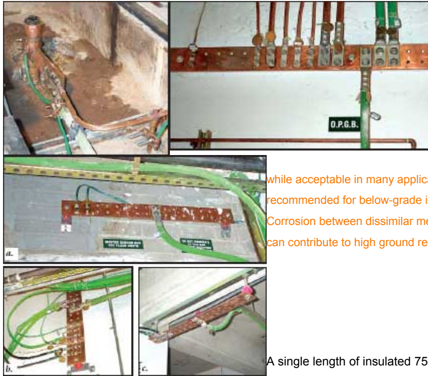
Figure 2. Connections between original grounding electrode conductors at the upper and lower terminal stations were found to be questionable. Some mechanical connectors, while acceptable in many applications, are not recommended for below-grade installations such as this. Corrosion between dissimilar metals, even if only slight, can contribute to high ground resistance values.

A single length of insulated 750-kcmil tinned copper cable connects the grounding electrode to the office principal ground bus (OPGB), a 1/4-in x 4-in x 48-in (6.3-mm x 100-mm x 1,219-mm) copper plate mounted on a nearby wall, midway between the building's north and east service entrances (Figure 3). The OPGB can be thought of as the main trunk of the grounding tree. All grounding circuits in the building terminate at this plate.