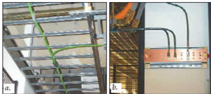
Figure 6. Tenants' equipment is located in cages or secured floor space. Equipotential grounding (EG) systems minimize electrical noise between networked equipment. Connection to the building's common grounding system is made via AWG 4/0 (or larger) copper conductors routed along overhead cable trays (a) to local grounding bars (b). Note that in this case, the EG systems' "raised floor" is actually overhead.

Connections between the MGBs and tenants' EG grounding systems are made via conductors routed along overhead cable trays to equipment cages, where they terminate at overhead- or wall-mounted grounding bars. Grounding conductors for large tenant areas are also routed along suspended trays. Thus, the DPTE's "raised floor" is actually overhead ( Figure 6 ).