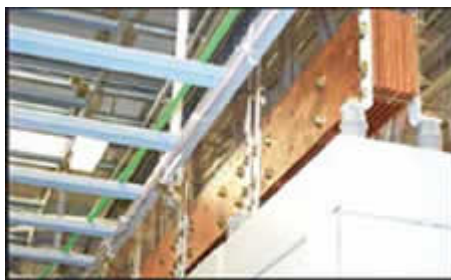
Figure 1. Electrical systems in Internet data centers are designed to accommodate higher power densities than those in conventional office space. The robust power buses shown here seem more appropriate for heavy machinery than for racks of electronic equipment. Power usage in IDCs has not been as high as originally anticipated, but power quality requirements remain more stringent than those of almost any other industry.

Because the DPTE was built for a new and growing market, Smith's electrical system plan called for maximum flexibility. Doug Newcomb sees that as a smart idea, considering the varied mix of tenants who have signed on. "Our tenants can design their own electrical systems," he explains. "We offer a mixture of circuits, and all services are hot swappable. Some of our large tenants designed their systems for power densities as high as 150-300 W/sq ft ( Figure 1 ). We can accommodate that, although I don't think those levels will actually be realized.