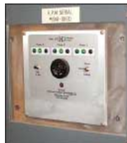
Figure 10. A system provided by Reliable Power Meters (RPM) continuously monitors and logs such power quality parameters as voltage, current and waveform.